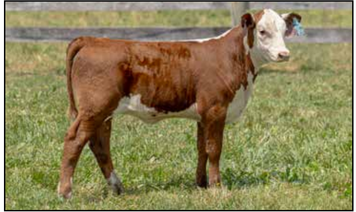
Lot 45A — DRF J13 RENEE G06 M13

45A DRF J13 RENEE G06 M13 COW P44568517 — Calved: 4/21/24 — Tattoo: RE DRF/LE M13 UPS SENSATION 2296 ET (SOD) [DLF,HYF,IEF,MSUDF,MDF,DBC] DRF E02 SENSATION 2296 G06 [DLF,HYF,IEF,MSUDF,MDF,DBC] P44012866 DRF X2 RENEE 3134 E02 [DLF,HYF,IEF,MSUDF,MDF] CHURCHILL SENSATION 028X (SOD) [DLF,HYF,IEF,MDF,DBC] UPS JT MISS NEON 7811 1ET [DLF,HYF,IEF,IEF,IEF] CHURCHILL STUD 3134A (SOD) [CHB] [DLF,HYF,IEF,MDF,DBC] DRF 53S K18 RENEE X2 [DLF,HYF,IEF,MSUDF,MDF] DRF 404 SAUVIGNON 29F 701 ET [DLF,HYF,IEF] DRF B3 RENEE 701 J13 P44012866 DRF X2 RENEE 064 B3 CS BOOMER 29F (SOD) [DLF,HYF,IEF] CRR 486S CABERNET 404 (HYP) HS SOLUTION 064 (SOD) [CHB] [DLF,HYF,IEF] DRF 53S K18 RENEE X2 [DLF,HYF,IEF,MSUDF,MDF]