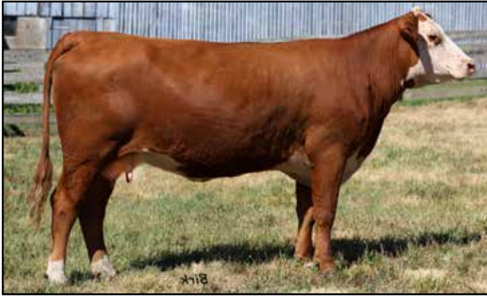
Lot 28 — GLENVIEW M13B BEAUTY J22

28 GLENVIEW M13B BEAUTY J22 {DLF,HYF,IEF,MSUDF,DBF} COW P44269384 — Calved: 3/25/21 — Tattoo: BE J22