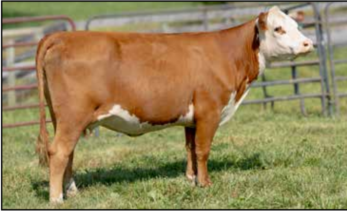
Lot 5 — ESF 23G 76G VICTORIA LASS