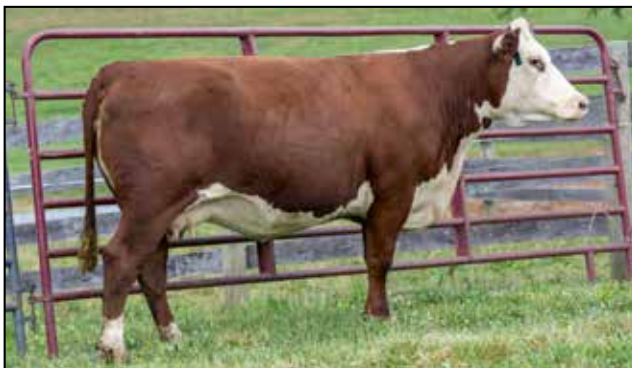
Lot 4 — CJF MISS JULIE J6