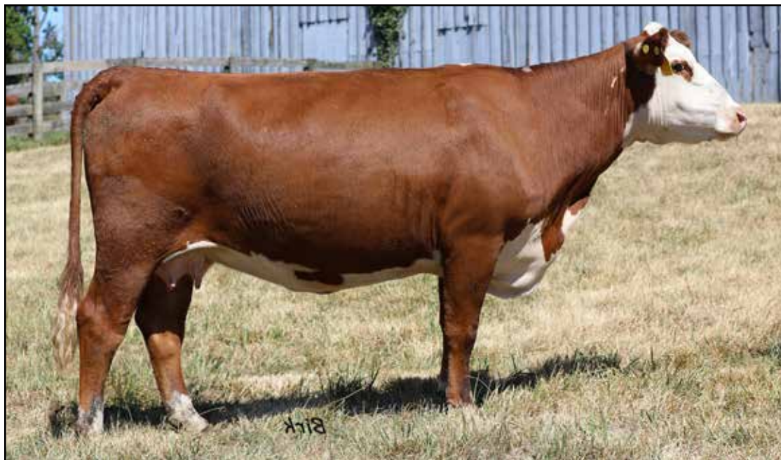
Lot 16 — CVF LLJ RAMBLIN ROSE 740H