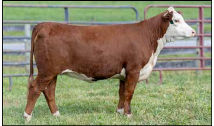
Lot 13 — ESF J20 83G YOSHI L559