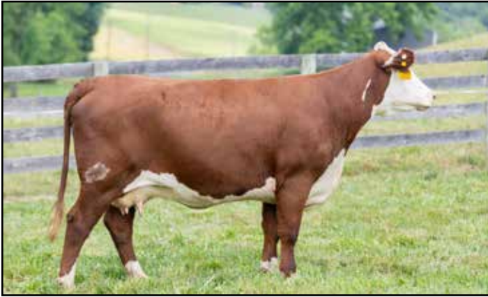
Lot 45 — DRF B3 RENEE 701 J13

45 DRF B3 RENEE 701 J13 COW P44325162 — Calved: 4/10/21 — Tattoo: RE DRF/LE J13 CS BOOMER 29F (SOD) [DLF,HYF,IEF] DRF 404 SAUVIGNON 29F 701 ET [DLF,HYF,IEF] P43863086 CRR 486S CABERNET 404 (HYP) HS SOLUTION 064 (SOD) [CHB] [DLF,HYF,IEF] DRF X2 RENEE 064 B3 43548787 DRF 53S K18 RENEE X2 [DLF,HYF,IEF,MSUDF,MDF] REMITALL BOOMER 46B (SOD) [DLF,HYF,IEF] CS MISS 1ST FLAG 21A (DOD) [DLF,HYF,IEF] GK 327L VINDICATOR 486S (SOD) CRR Y166 CABERNET 205 (DOD) [HYP] CHURCHILL YANKEE ET (SOD) [CHB] [DLF,HYF,IEF] HS MS 9213 DOMET 410 [DLF,HYF,IEF] NJW 8E 120J EMBASSY 53S ET DRF RENEE 28E K18