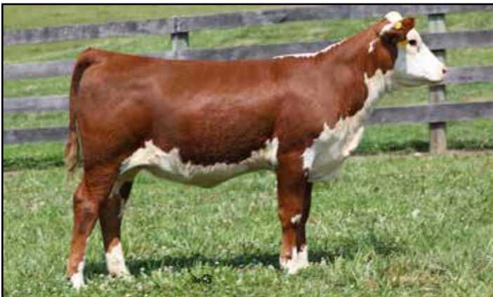
EST G406 83G WINNIE K490 — Daughter of Lot 1