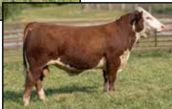
ESF 1903 018 YAMIR L535 — Son of Lot 7