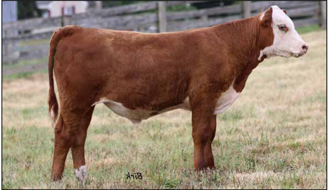
Lot 16A — CHURCH VIEW FINAL SHOT 011M