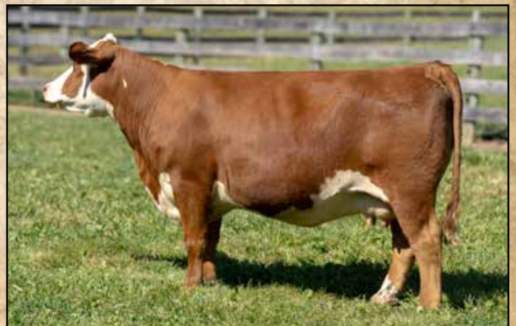
Lot 2 — CJF JOLENE J3