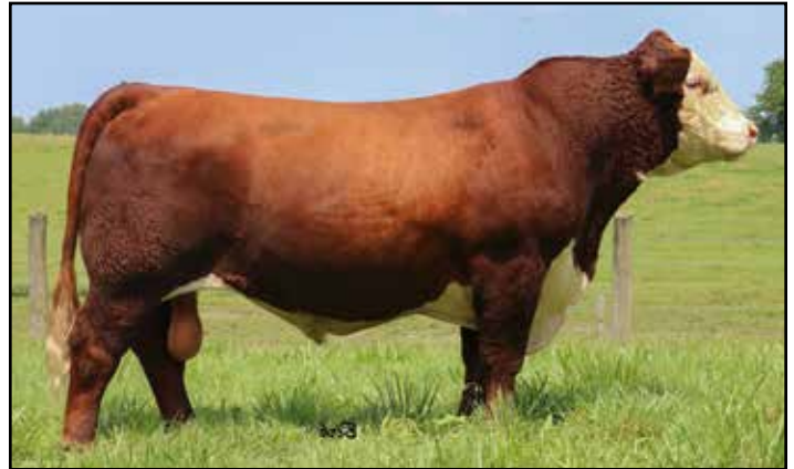
CHURCH VIEW LLJ DI RAMBO 611G — Reference Sire for Lots 18, 20 and 22A