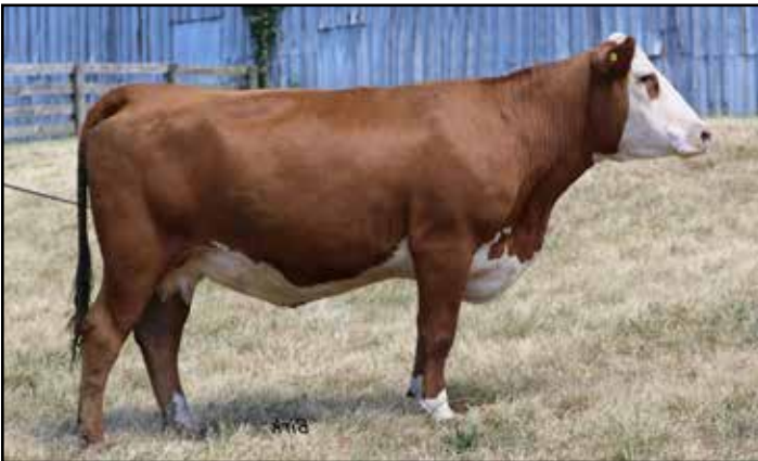
Lot 22 — RHF 33B JOY N THE MORNIN 0018H