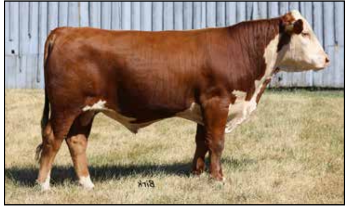
Lot 29 — CHURCH VIEW LLJ E33 KING 919L