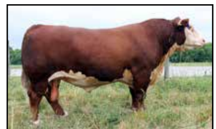
SRF EQUINOX 38E — Sire of Lots 32 and 33