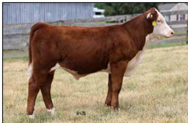
Lot 41 — SBF LUCIAN