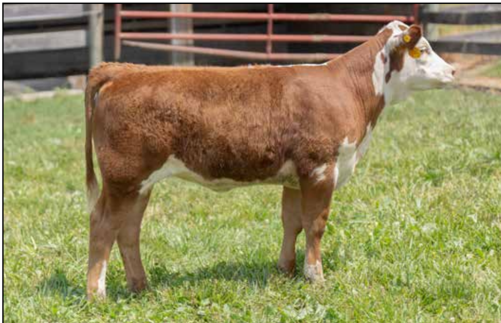
Lot 2A — ESF J3 21J MAGGIE M608