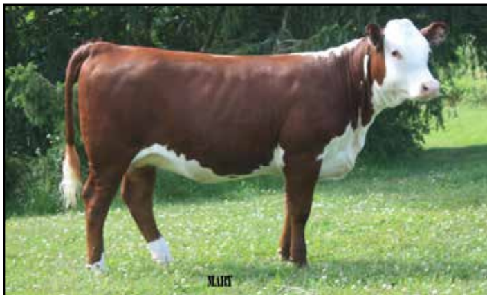
Lot 50 — JDS MISS JULIET 977