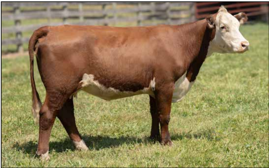
Lot 35 — BR 1H REMY 4K