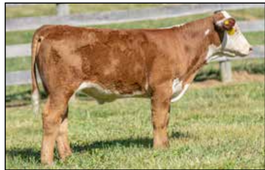
Lot 11A — ESF E05 21J MITCHELL M611