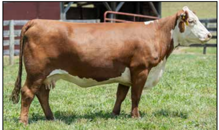
Lot 46 — DRF 4171 KAILEY 2296 G15

46 DRF 4171 KAILEY 2296 G15 [DLF,HYF,IEF,MSUDF,MDF,DBC] COW P44105991 — Calved: 12/23/19 — Tattoo: LE G15/RE DRF CHURCHILL SENSATION 028X (SOD) [DLF,HYF,IEF,MDF,DBC] UPS SENSATION 2296 ET (SOD) [DLF,HYF,IEF,MSUDF,MDF,DBC] 4331175 UPS JT MISS NEON 7811 1ET [DLF,HYF,IEF,IEF,IEF] UPS SENSATION 2296 ET (SOD) [DLF,HYF,IEF,MSUDF,MDF,DBC] THM 2108 KAILEY 4171 (DOD) [HYP] P443459312 THM 6056 VICTORIA 2134 (HYP) UPS DOMINO 3027 (SOD) [CHB] [DLF,HYF,IEF,MSUDF,MDF] CHURCHILL LADY 7202T ET [DLF,HYF,IEF] GH NEON 17N (SOD) [CHB] [DLF,HYF,IEF,MSUDF] LCC TWO TIMIN 438 ET [DLF,HYF,IEF,IEF,IEF] NJW 73S M326 TRUST 100W ET (SOD) [CHB] [DLF,HYF,IEF,MSUDF,MDF,DBC] JLG VICTRA 163M 5628 [DLF,HYF,IEF] THM SOLUTION 6056 (HYP) THM 4066 VICTORIA 9445 (HYP) 442