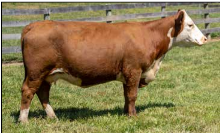
Lot 36 — BR 5051 KELLYANNE 5H