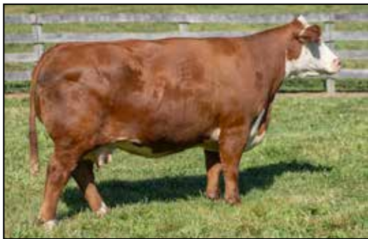
Lot 11 — ROPF ESTEE LAUDER E05