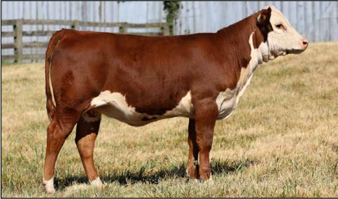
Lot 23A — CHURCH VIEW 156J STELLAR 843M