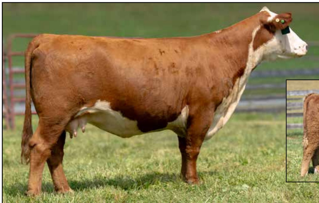
Lot 8 — MF 486 HILDA 8815F 17H ET