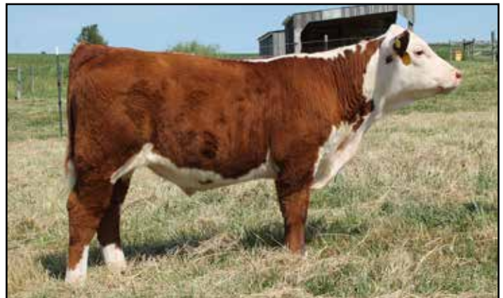
Lot 34A — HCC OLLIE M118