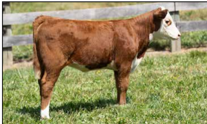
Lot 36A — BR 216J ANNIE 8M