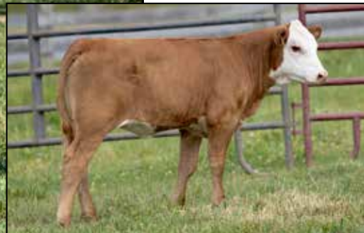
Lot 3A — ESF J20 21J MADELEINE M610