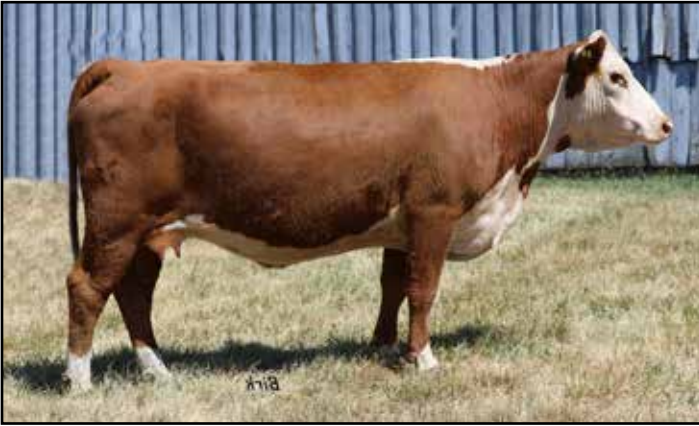
Lot 26 — CHURCH VIEW REDWINE 931H

26 CHURCH VIEW REDWINE 931H {HYP} COW P44146111 — Calved: 3/2/20 — Tattoo: RE CVF/LE 931H