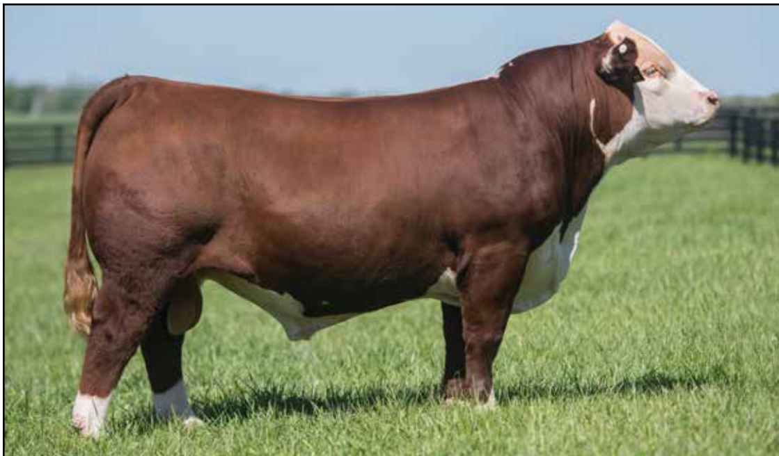
BOYD POWER SURGE 9024 — Sire of Lot 38