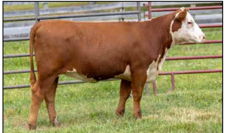
Lot 14 — ESF 931B 21J YAMIKA L547