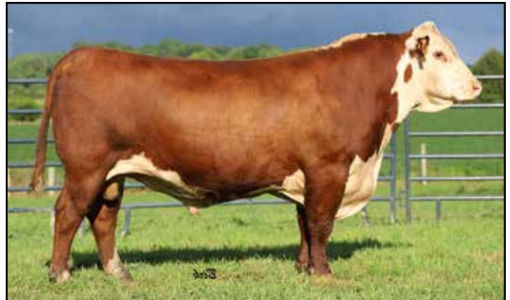
JLCS Z426 STEP AHEAD F30 ET — Service Sire for Lots 16, 17, 18, 19, 20, 21, 22, 23, 25, 26, 27 and 28