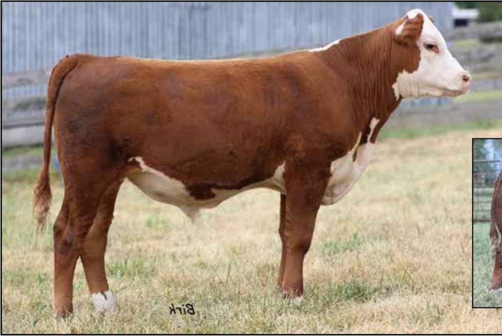
Lot 17A — CHURCH VIEW LAST CALL 012M