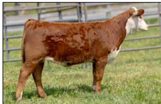
Lot 9A — ESF F366 9024 MADELINE