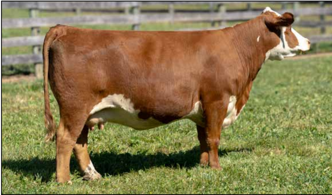
Lot 2 — CJF JOLENE J3