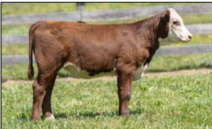
Lot 35A — BR 002 TRISHA 2M