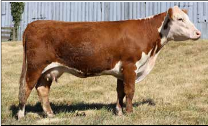
Lot 24 — CHURCH VIEW EXTRA SPECIAL 825G