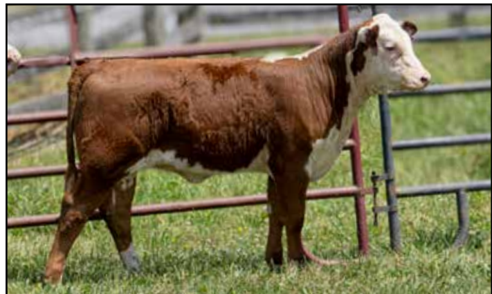
Lot 44A — DRF J02 CABERNET 156J M07