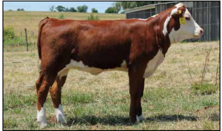
Lot 33 — JR HCC CELESTIAL M116