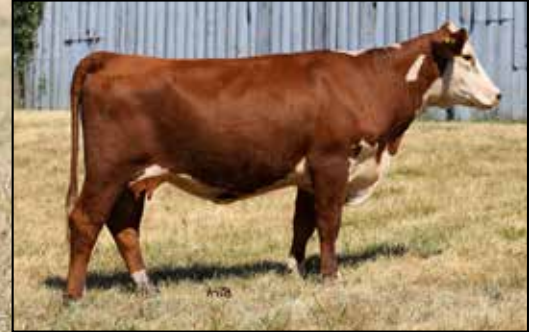
Lot 18 — CHURCH VIEW 611G RAELYNN 016K