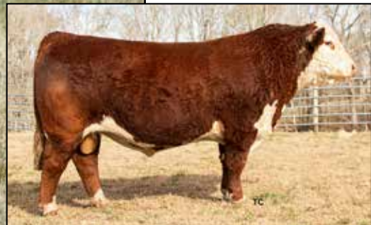
NJW 202C 173D STEADFAST 156J ET — Reference Sire of Lots 23A, 24A, 25A and 27A