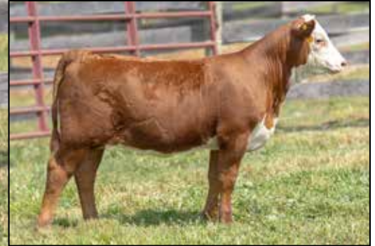
Lot 10 — ESF D246 10Y SAGE