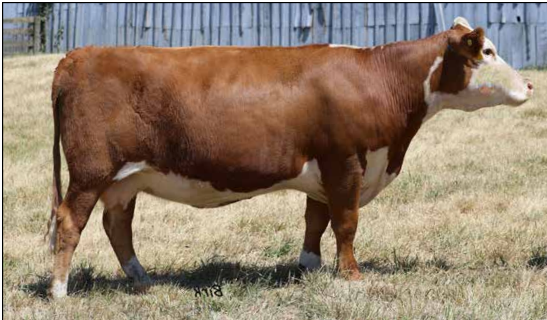
Lot 17 — CHURCH VIEW RAMBLIN ROSE 818H