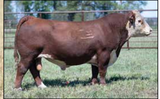
RST FINAL PRINT 0016 — Reference Sire of Lots 16A, 17A and 18A