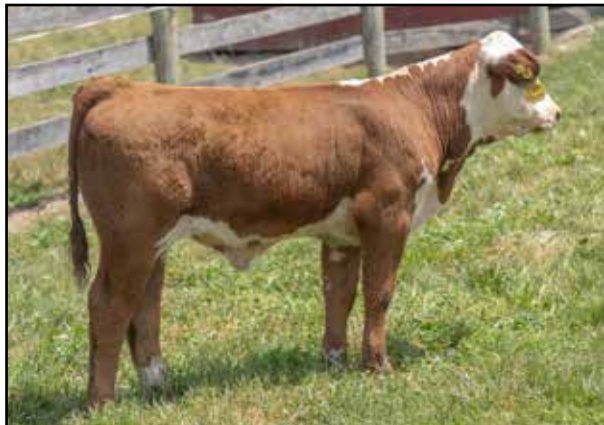
Lot 46A — DRF G15 SENSATION G06 M09

46A DRF G15 SENSATION G06 M09 {DBP} BULL P44568492 — Calved: 3/28/24 — Tattoo: RE DRF/LE M09 UPS SENSATION 2296 ET (SOD) [DLF,HYF,IEF,MSUDF,MDF,DBC] DRF E02 SENSATION 2296 G06 [DLF,HYF,IEF,MSUDF,MDF,DBC] P44012866 DRF X2 RENEE 3134 E02 [DLF,HYF,IEF,MSUDF,MDF] CHURCHILL SENSATION 028X (SOD) [DLF,HYF,IEF,MDF,DBC] UPS JT MISS NEON 7811 1ET [DLF,HYF,IEF,IEF,IEF] CHURCHILL STUD 3134A (SOD) [CHB] [DLF,HYF,IEF,MDF,DBC] DRF 53S K18 RENEE X2 [DLF,HYF,IEF,MSUDF,MDF] UPS SENSATION 2296 ET (SOD) [DLF,HYF,IEF,MSUDF,MDF,DBC] DRF 4171 KAILEY 2296 G15 [DLF,HYF,IEF,MSUDF,MDF,DBC] P44105991 THM 2108 KAILEY 4171 (DOD) [HYP] CHURCHILL SENSATION 028X (SOD) [DLF,HYF,IEF,MDF,DBC] UPS JT MISS NEON 7811 1ET [DLF,HYF,IEF,IEF,IEF] THM AVATAR 2108 ET [CHB] [DLF,HYF,IEF] THM 6056 VICTORIA 2134 (HYP)