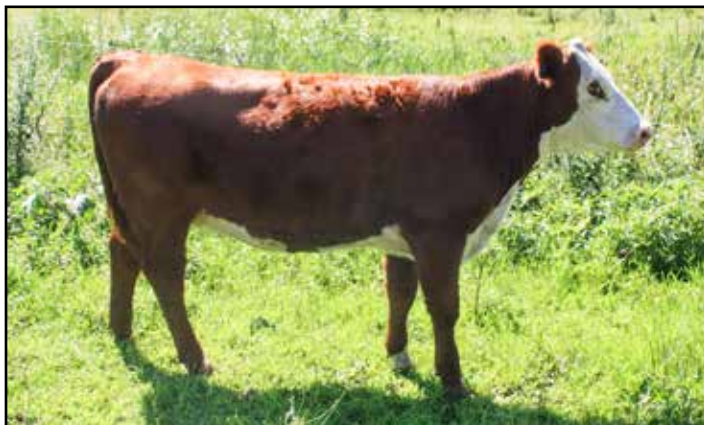
Lot 51 — JDS TINGLEY SENSATION 2296 K22