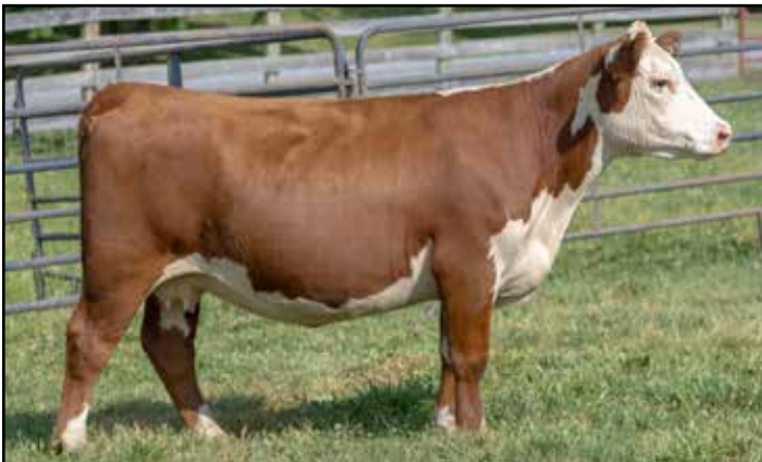
Lot 6 — ESF Y14 83G WYNN J487

• Wynn is a perfect example of the cow power that Mohican BB can provide. Bred AI on 5/2/24 to NJW 133A 6587 Manifest 87G ET, then pasture exposed from 5/6/24 to sale date to Mohican BB 83G ET.