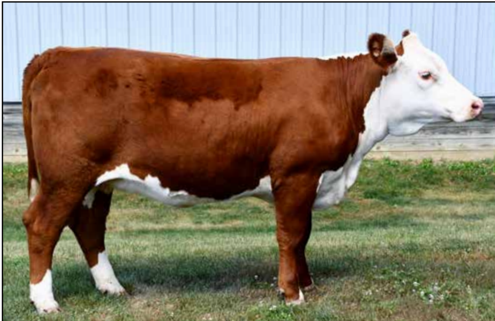
Lot 42 — SRF MASTERPLAN'S MILA L02