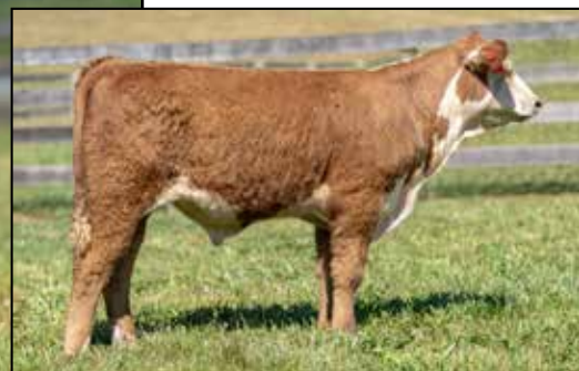
Lot 8A — ESF 17H 2296 MAXWELL M593