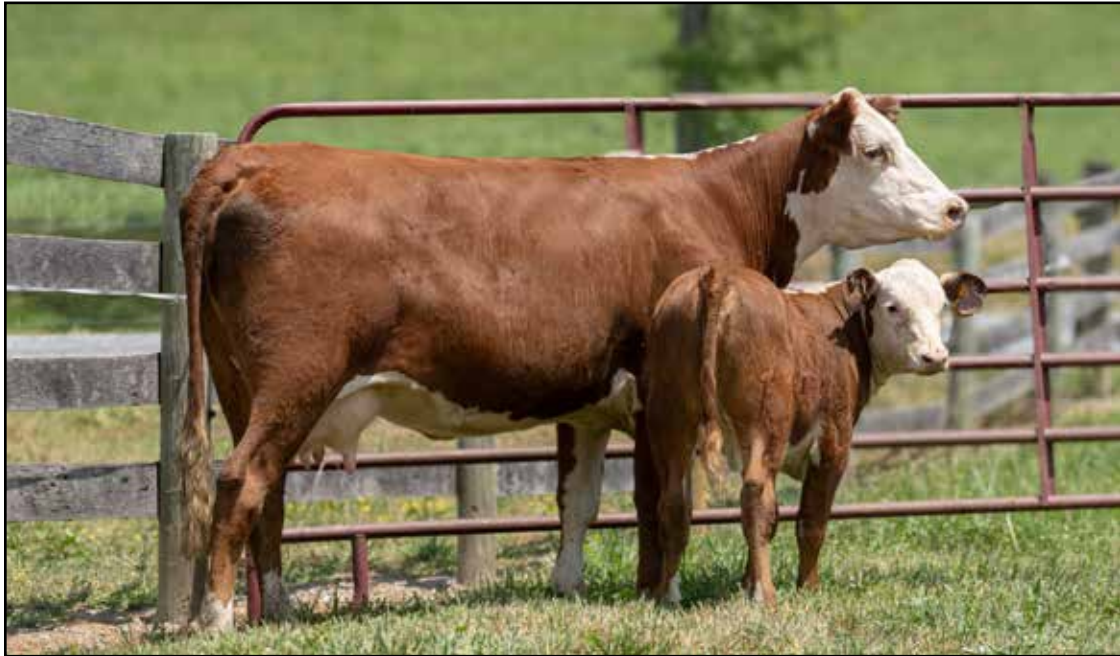
Lot 44 — DRF R10 RADIANT 701 J02