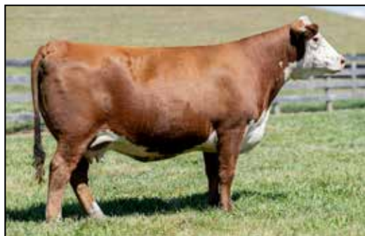
Lot 9 — ESF D41 C229 SANDY