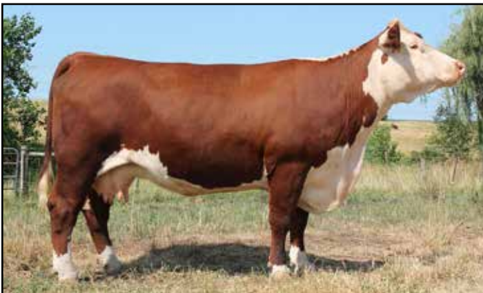
Lot 34 — MARBENS WISHFUL H80