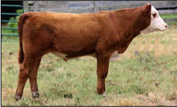
Lot 26A — CHURCH VIEW 254G RIDER 027M

26A CHURCH VIEW 254G RIDER 027M {DLF,HYF,IEF,MSUDF} BULL P44546365 — Calved: 2/1/24 — Tattoo: RE CVF/LE 027M