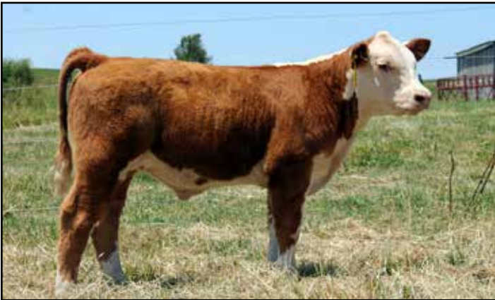
Lot 31 — HCC FINAL DRAW M130