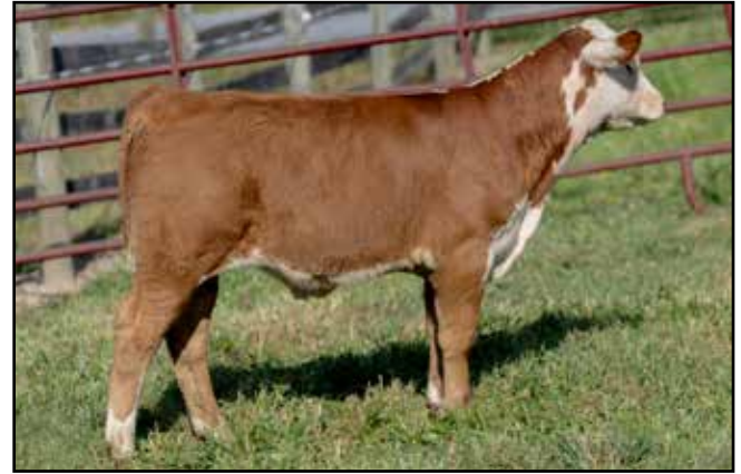
Lot 5A — ESF J483 21J MAVERICK M615