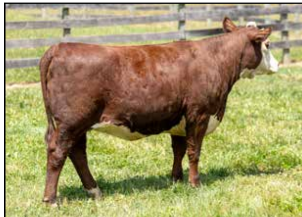
Lot 37 — BR 1H MADELYN 6L