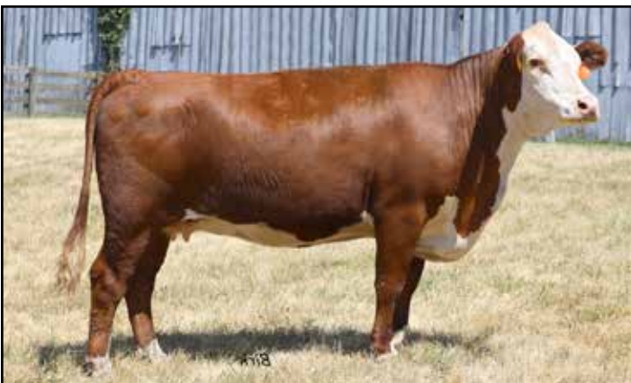
Lot 19 — RHF D1 TURN THE PAIGE 0032H