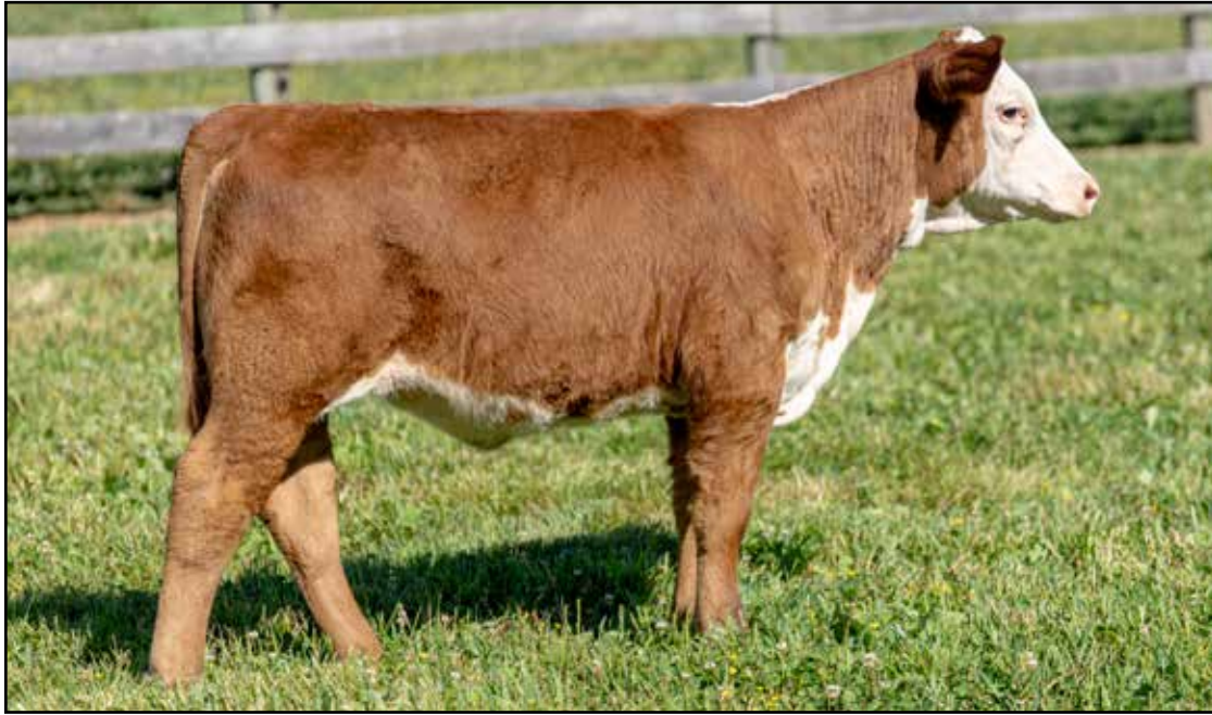
Lot 12A — ESF 05K 41E MAGNOLIA M606