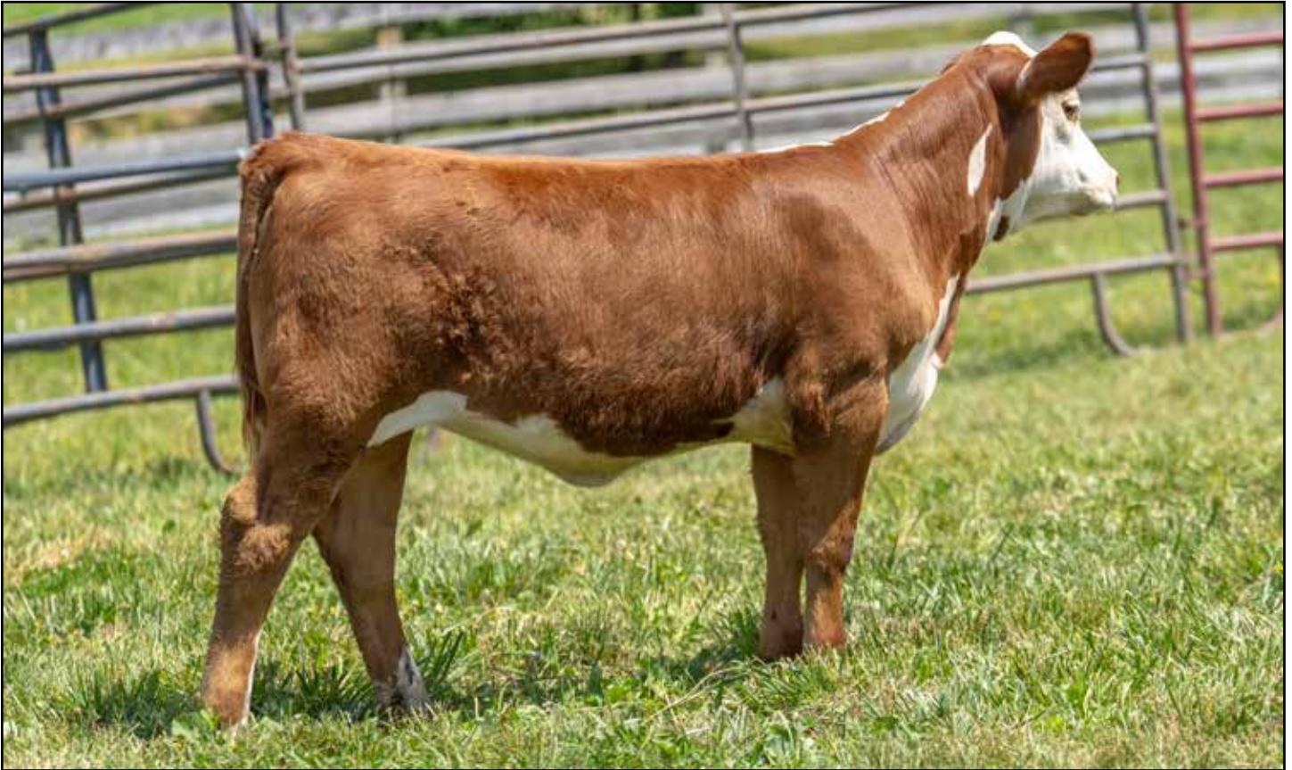
Lot 7A — ESF 1903 21J MAREN M607