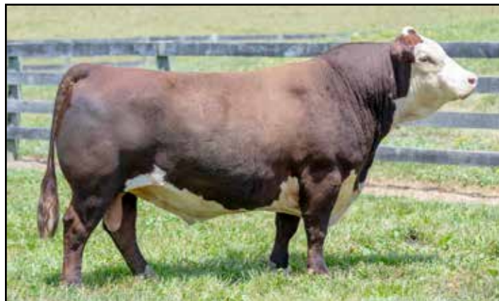
BR 203D RANCHER 1H — Sire of Lots 35 and 37 • Service Sire of Lot 36