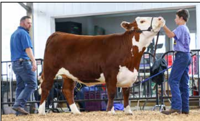
Lot 43 — SRF LADY LIBERTY K02

• This Masterplan heifer has tons of potential, she is a simple, easy keeper. She will make a great cow addition to any herd. She is halter broke and has been shown by our daughter. She will be bred and confirmed before sale.