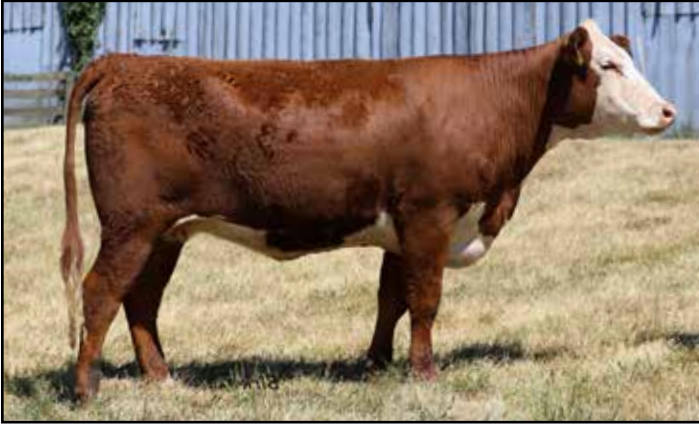
Lot 20 — CHURCH VIEW LLJ RAE LYNN 015K