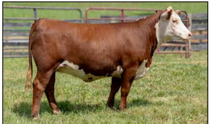
Lot 15 — ESF IC 21J YAFFA L544