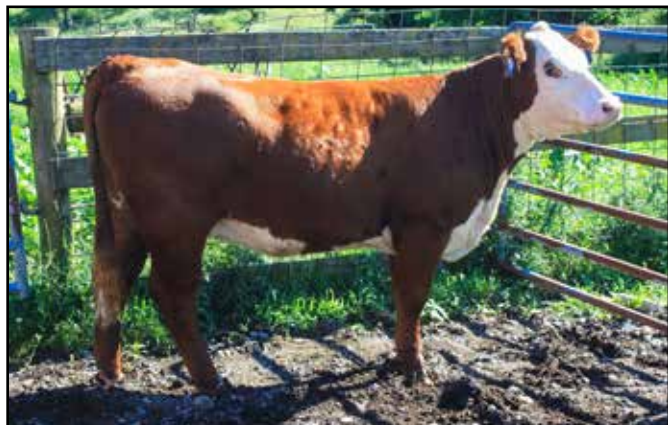
Lot 52 — JDS MISS ESSENTIAL 9365 K21