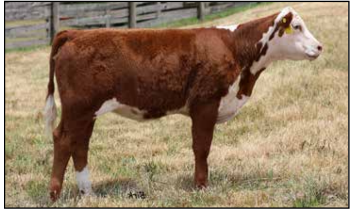
Lot 24A — CHURCH VIEW 156J STELLAR 917M