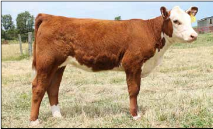
Lot 32 — HCC RAVEN SUE M46