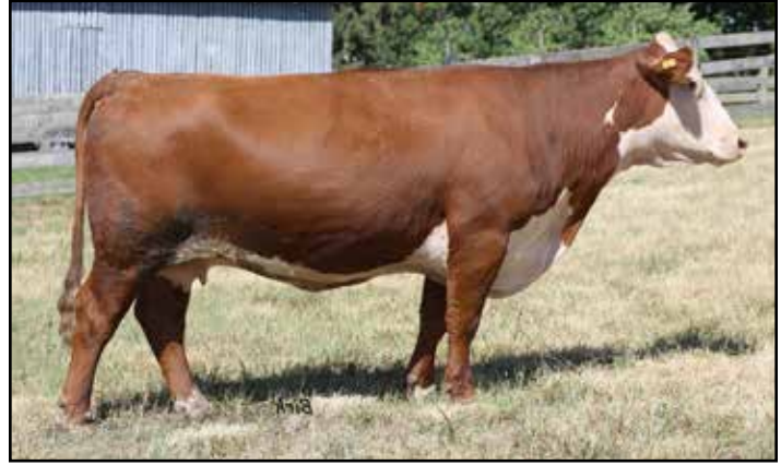
Lot 21 — KC 1285 BIG SAL 8Y 2069