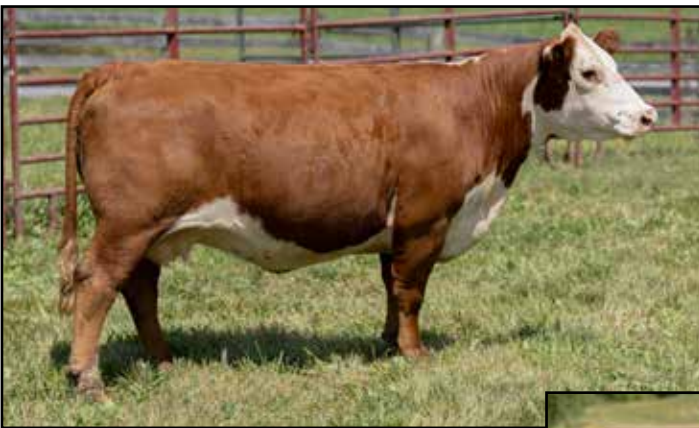
Lot 7 — MF 486 GRETA 6026D 1903 ET