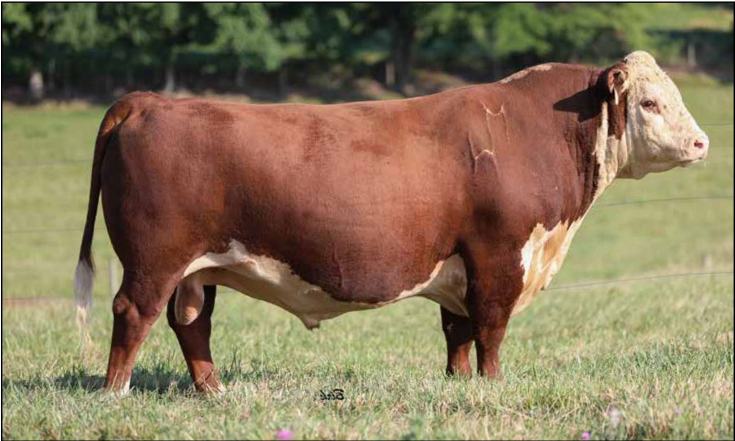
Lot 1 — MOHICAN BB 83G ET