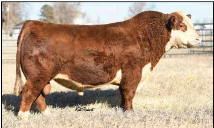
BOYD 31Z BLUEPRINT 6153 — Sire of Lot 1