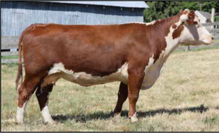
Lot 27 — CHURCH VIEW 078 CORINA 431G

27 CHURCH VIEW 078 CORINA 431G {HYP} COW P44016345 — Calved: 3/2/19 — Tattoo: RE CVF/LE 431G