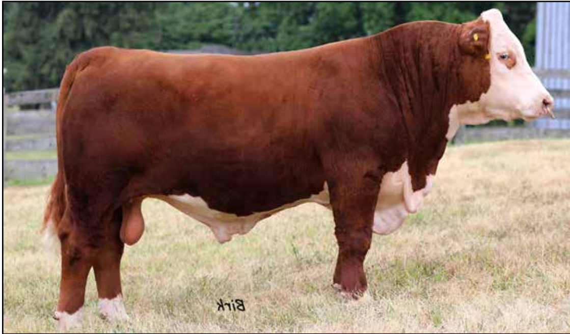
Lot 38 — SBF PAXTON