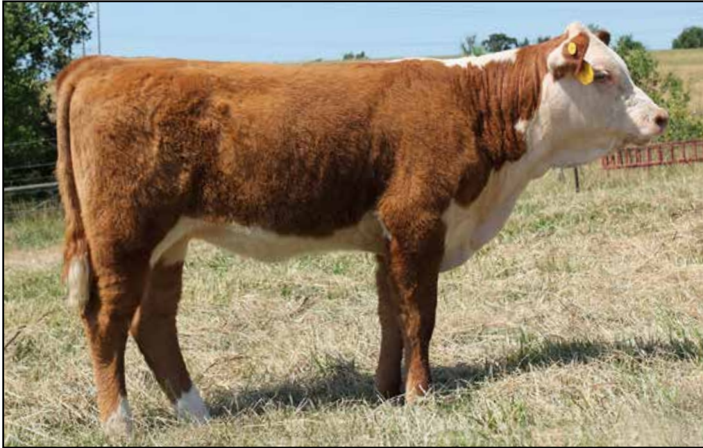
Lot 30 — HCC K HAZEL M136