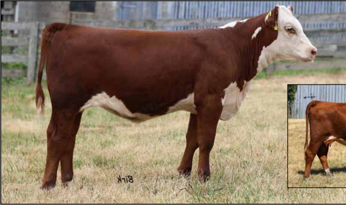
Lot 18A — CHURCH VIEW LLJ PRINCESS 222M