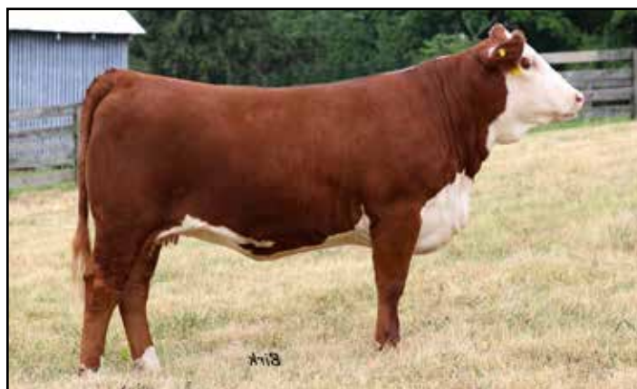
Lot 39 — SBF MISS CHANEL