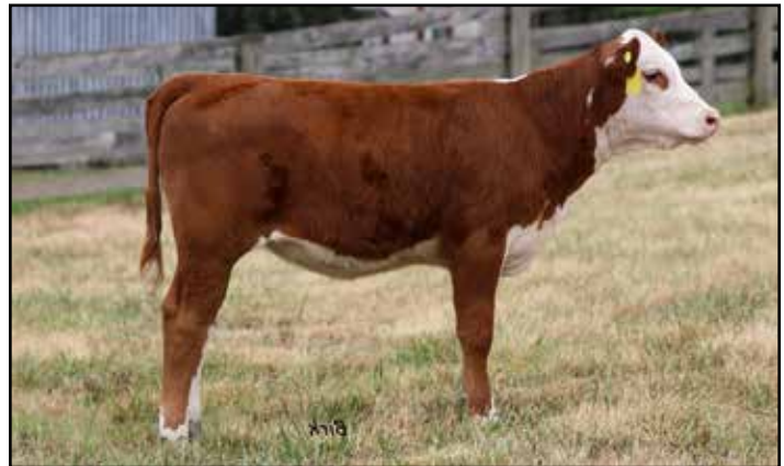
Lot 22A — CHURCH VIEW 611G RAE LYNN 035M