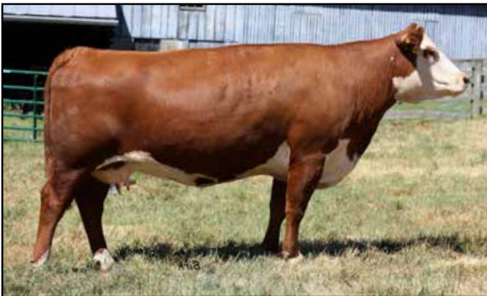
Lot 25 — ASF SCARLETT 13G