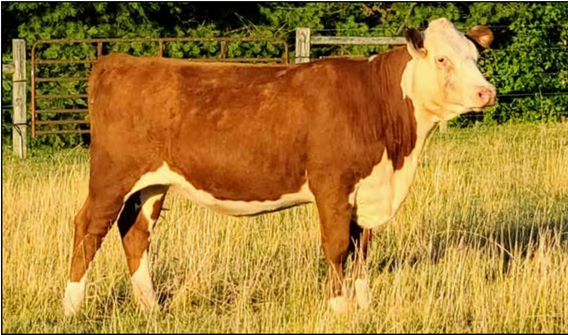
Lot 53 — WCC PATSY