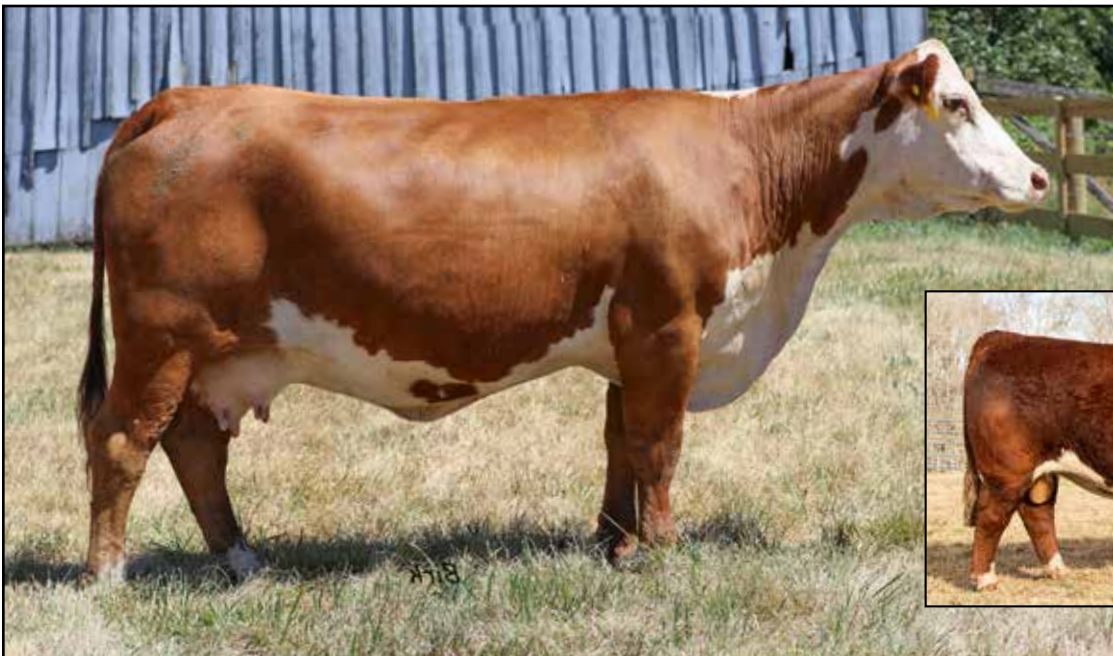
Lot 23 — ECA 6195 FABLE 6125 1FF