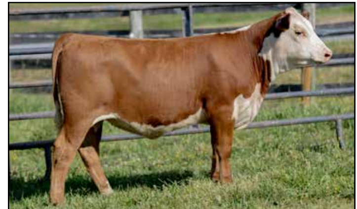
Lot 6A — ESF J487 21J MAE M582