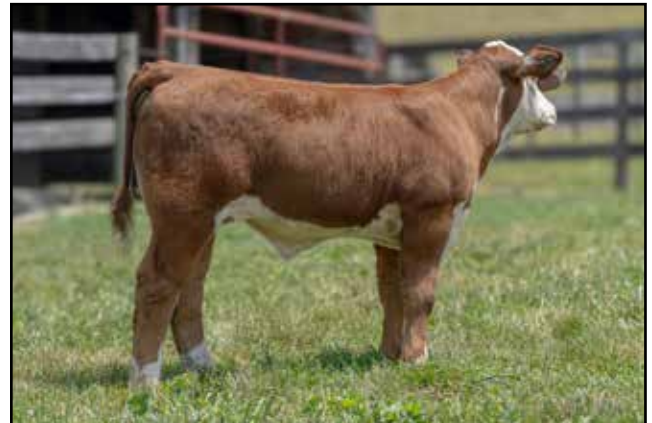
Lot 47A — M04