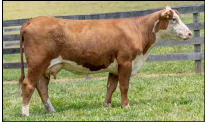
Lot 47 — CLEOPATRA