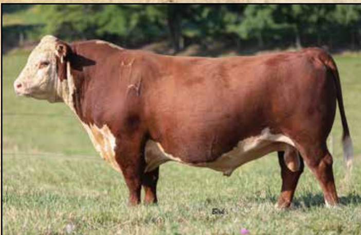
LOT 1 — MOHICAN BB 83G ET