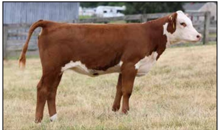
Lot 25A — CHURCH VIEW 156J STELLAR 949M