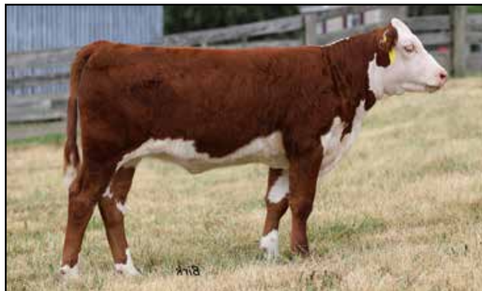
Lot 40 — SBF MISS CLOUDY