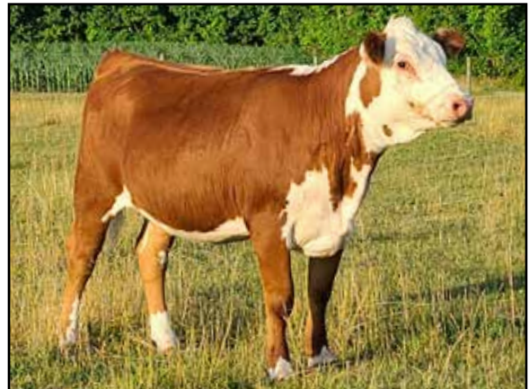
Lot 54 — WCC DOLLY